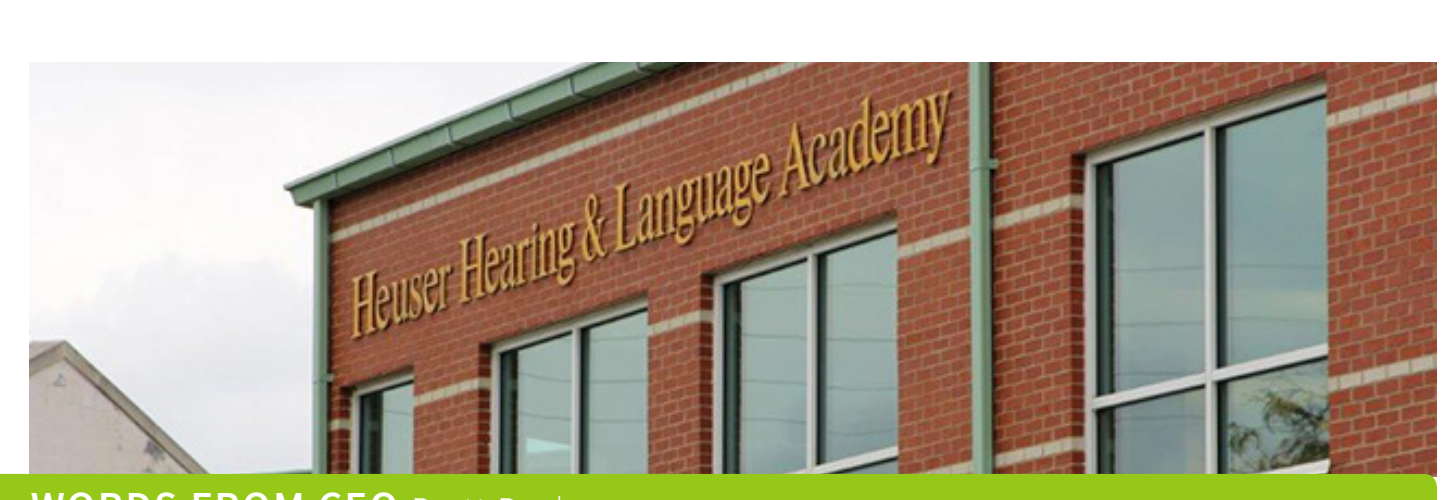
WORDS FROM CEO